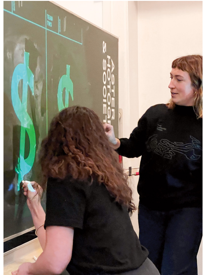
Nalbantska and Boslau playing the Beziergame (MA Type and Media, 2023)

Read more about the Master's in Type and Media at www.kabk.nl or check Instagram @typeandmedia