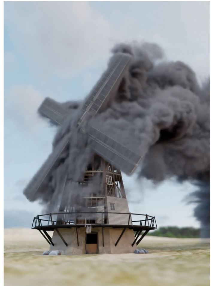
Work of Jaehun Park, Overheated Windmill (MA Artistic Research, 2020), still image from 3D animation

Read more about the Master's in Artistic Research at www.kabk.nl or check Instagram @masterartisticresearch