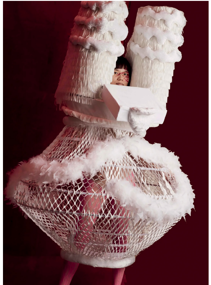
Work of Zhenyi Zhou (BA Textile & Fashion, 2022)

Read more about the Bachelor's in Textile & Fashion at www.kabk.nl or check Instagram @fashion_textile_the_hague