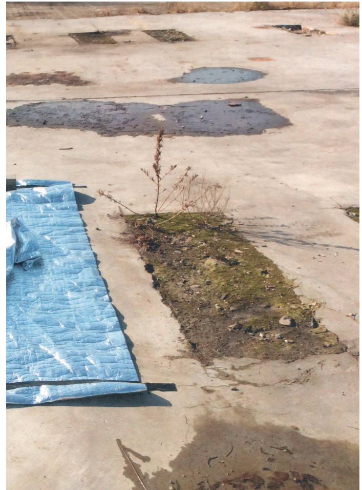
Collective project of IAFD year 3, Transtructure (BA Interior Architecture & Furniture Design, 2023), photo: Kostantin Maksimov

Read more about the Bachelor's in Interior Architecture & Furniture Design at www.kabk.nl or check Instagram @kabk_ia_fd