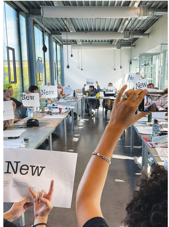
Tools to dismantle the Master's House (BA Graphic Design, 2023), project week

Read more about the Bachelor's in Graphic Design at www.kabk.nl or check Instagram @kabkdesign